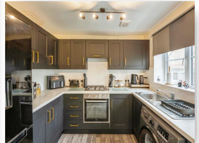
Blunn Croft, Kilnhurst Mexborough S64 5WJ