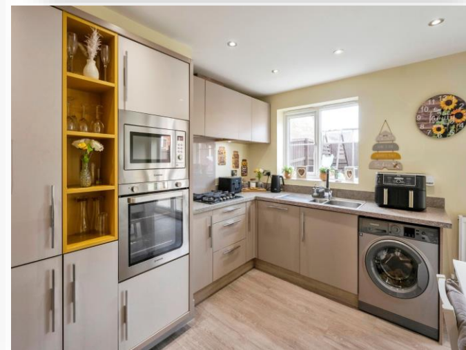
Ceramia Court, Goldthorpe Rotherham S63 9GR