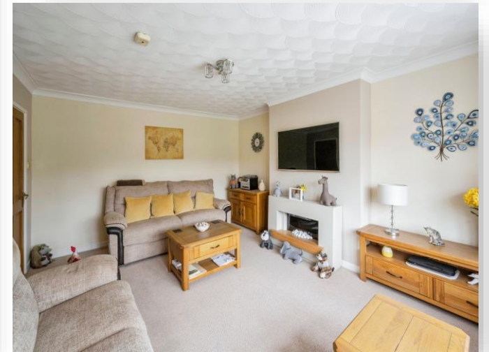
St. Andrews Close, Swinton Mexborough S64 8SR