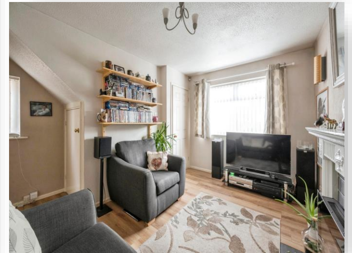
Celandine Rise, Swinton Mexborough S64 8NZ