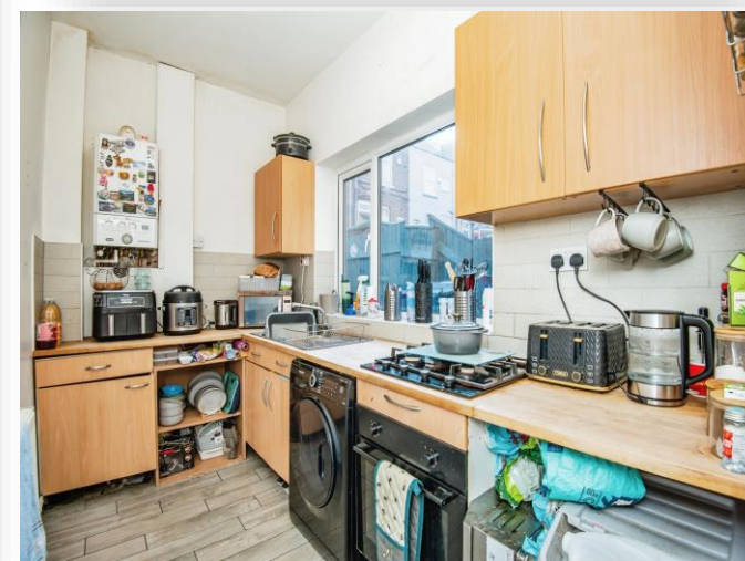
Taylor Street, Conisbrough Doncaster DN12 3EP