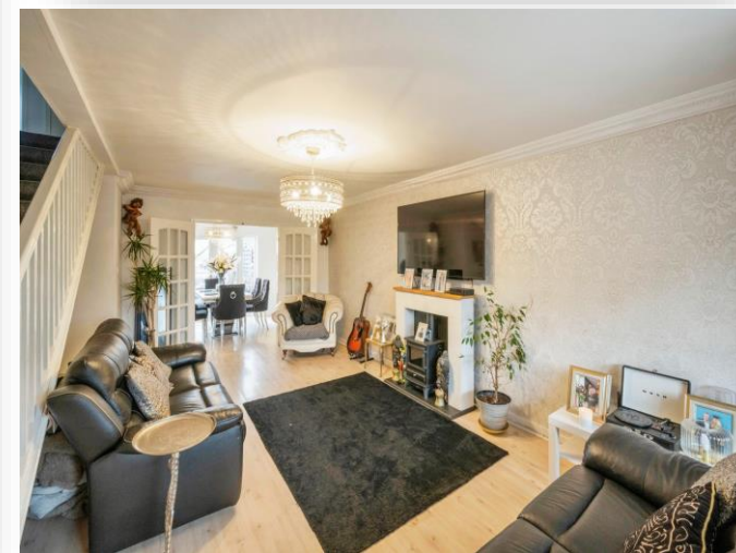
Cliffe House Princess Road, Mexborough S64 0AW