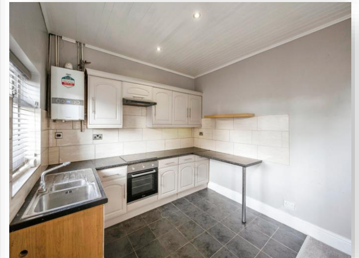
Rowms Lane, Swinton Mexborough S64 8AE