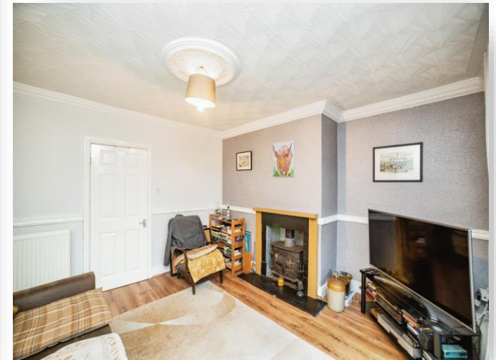
Ingsfield Lane, Bolton-Upon-Dearne Rotherham S63 8EJ