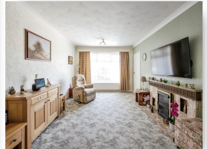
West View Crescent, Goldthorpe Rotherham S63 9BB