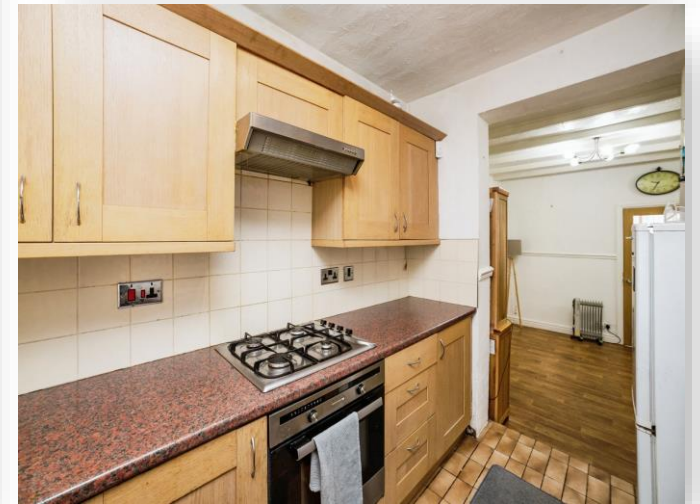
Lesley Road, Goldthorpe Rotherham S63 9DH