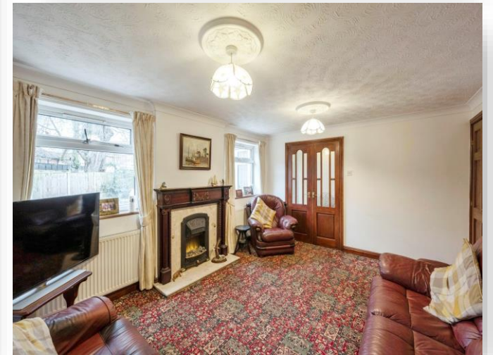
Low Grange Road, Thurnscoe Rotherham S63 0LH