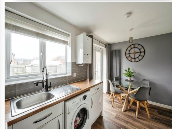
Thomas Hill Grove, Kilnhurst Mexborough S64 5WG