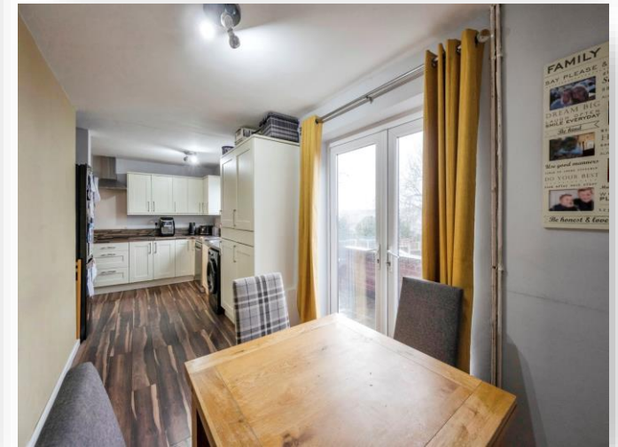
Roberts Avenue, Conisbrough Doncaster DN12 2DB