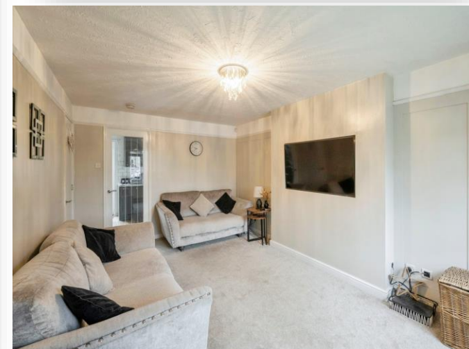
Berry Edge Close, Conisbrough DONCASTER DN12 2LR