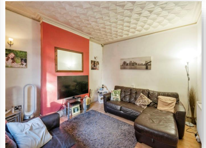
Low Road, Conisbrough DONCASTER DN12 3AB