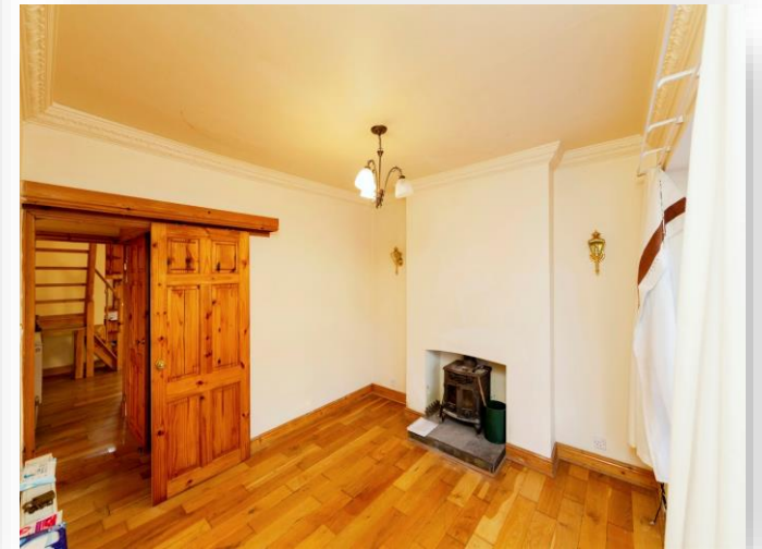
Park Road, Mexborough S64 9PE