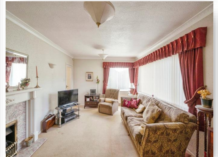
Holly Grove, Wath-Upon-Dearne Rotherham S63 7PJ