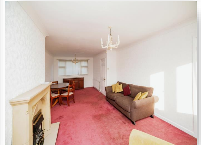
Holywell Lane, Conisbrough Doncaster DN12 2BP