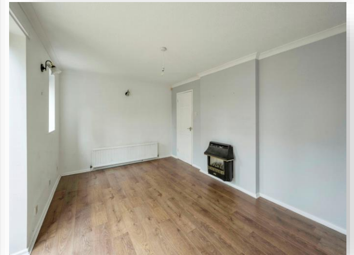
Pine Walk, Swinton Mexborough S64 8RB