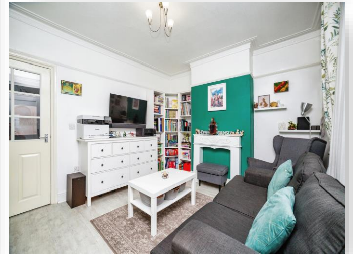
Dodsworth Street, Mexborough S64 9NA