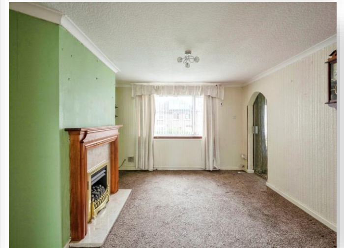
Burns Way, Wath-Upon-Dearne Rotherham S63 6ED