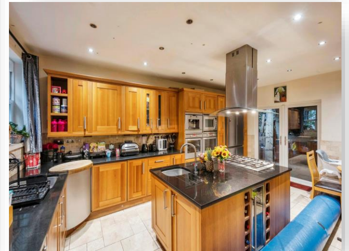
Coeben Cottage Castle Avenue, Conisbrough Doncaster DN12 3BT