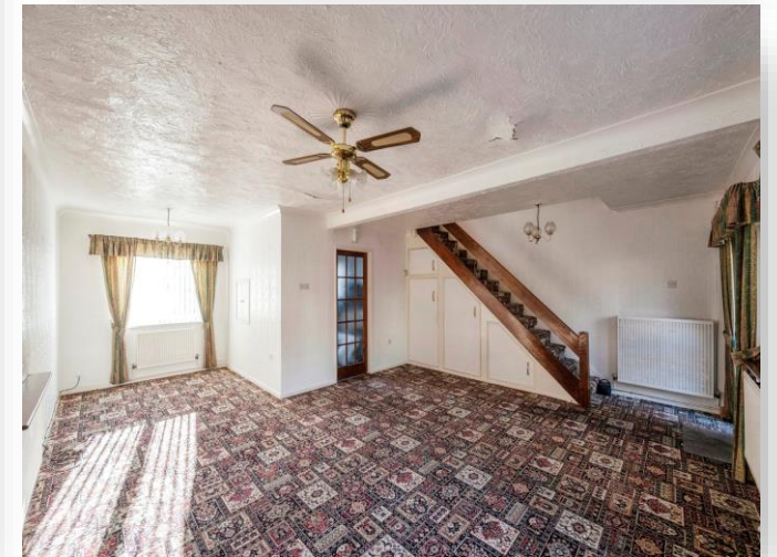
Clover Walk, Bolton-Upon-Dearne Rotherham S63 8BY