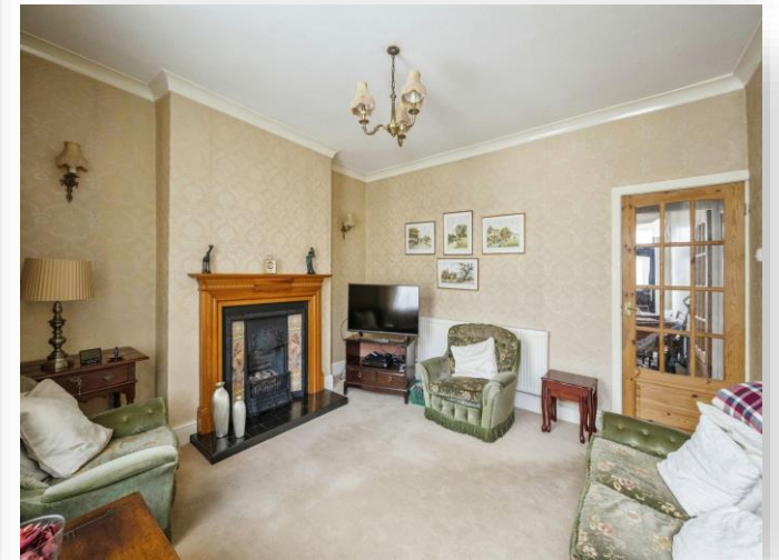
Avenue Road, Wath-Upon-Dearne Rotherham S63 7AH