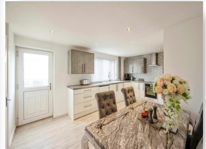
Lime Tree Walk, Denaby Main Doncaster DN12 4TE