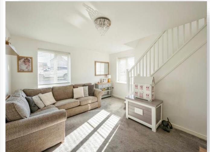
Ellison Drive, Kilnhurst Mexborough S64 5WB