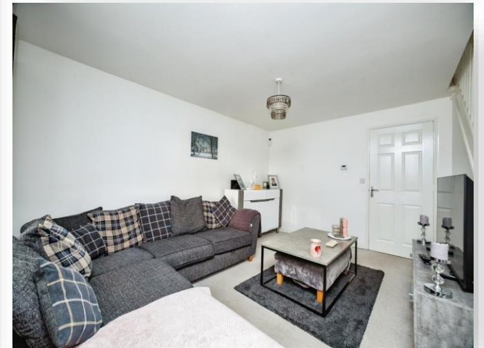
Thomas Hill Grove, Kilnhurst Mexborough S64 5WG