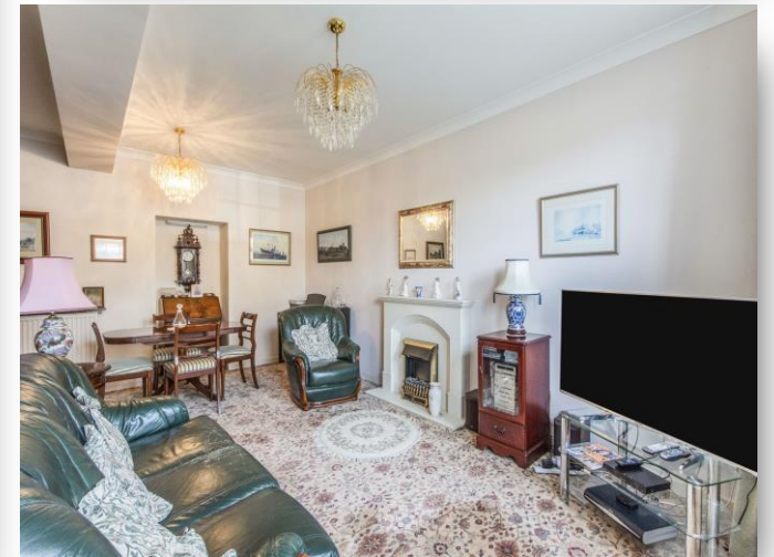
Swinton Hall Fitzwilliam Street, Swinton Mexborough S64 8RE