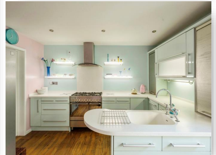
The Shed Church Lane, Barnburgh Doncaster DN5 7EU