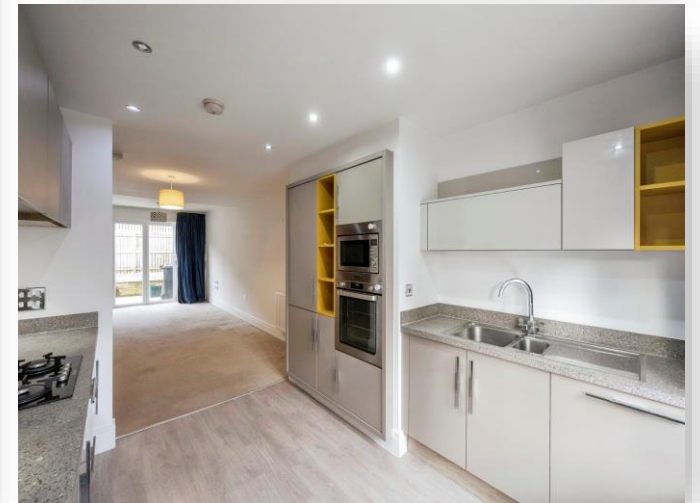
Avocet Close, Mexborough S64 0FJ