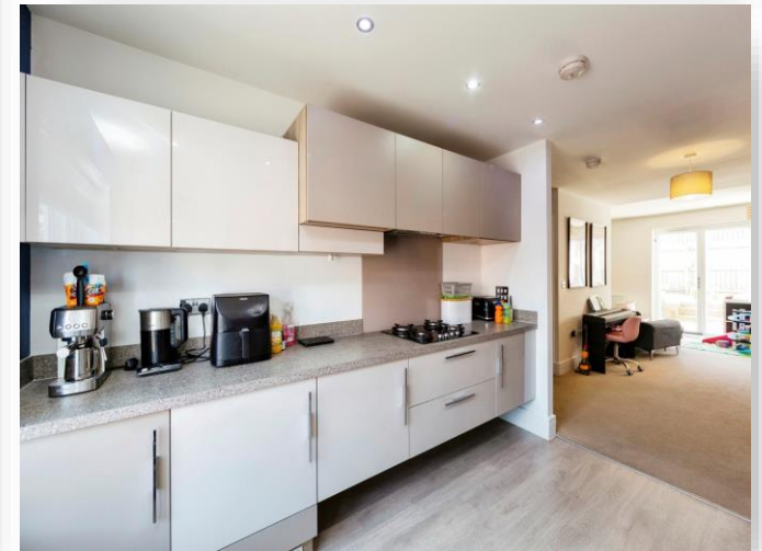
Avocet Close, Mexborough S64 0FJ