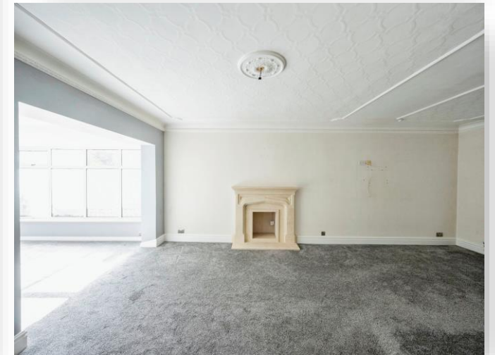
Brooklands March Gate, Conisbrough Doncaster DN12 2EG