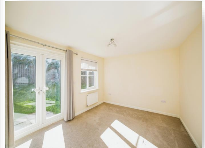
Pickhills Grove, Goldthorpe Rotherham S63 9FN