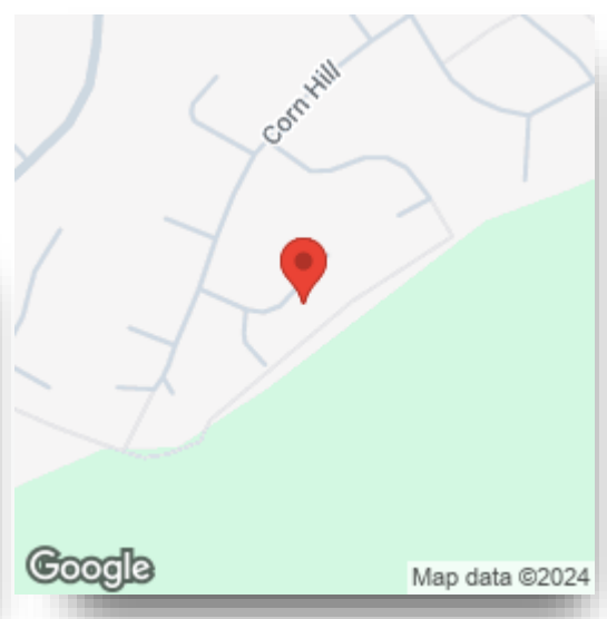
Please note the marker reflects the postcode not the actual property