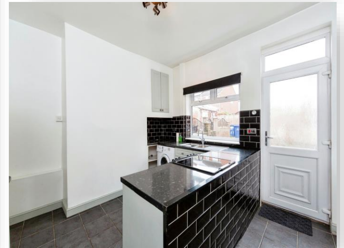
Barker Street, Mexborough S64 9RA