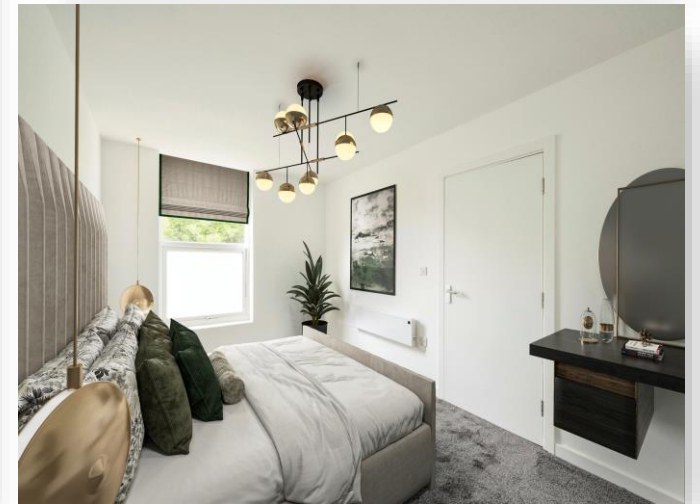
Bank Street, Mexborough S64 9LL