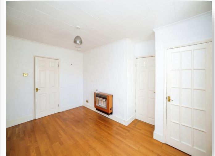
Chestnut Grove, Conisbrough Doncaster DN12 2JH