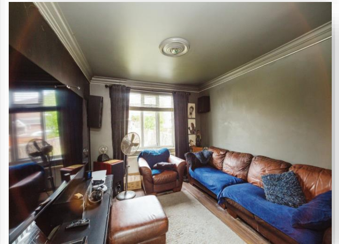
Hope Avenue, Goldthorpe Rotherham S63 9DT