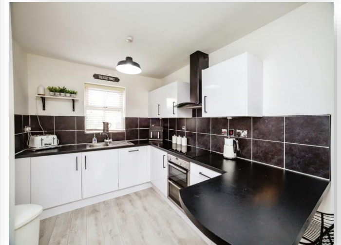
Kingsbrook Chase, Wath-Upon-Deerne Rotherham S63 7FB