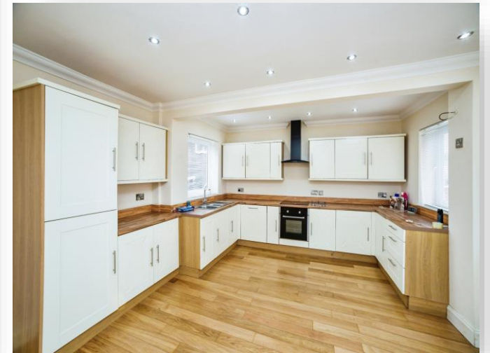
Pym Road, Mexborough S64 9BJ