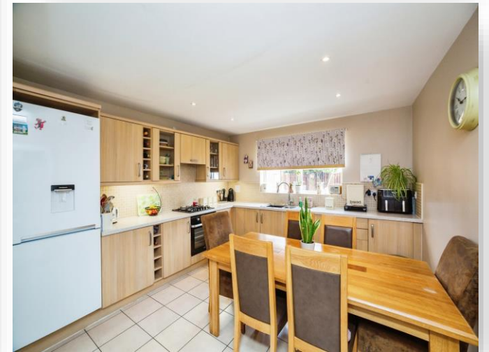
Waterway Lane, Kilnhurst Mexborough S64 5SS