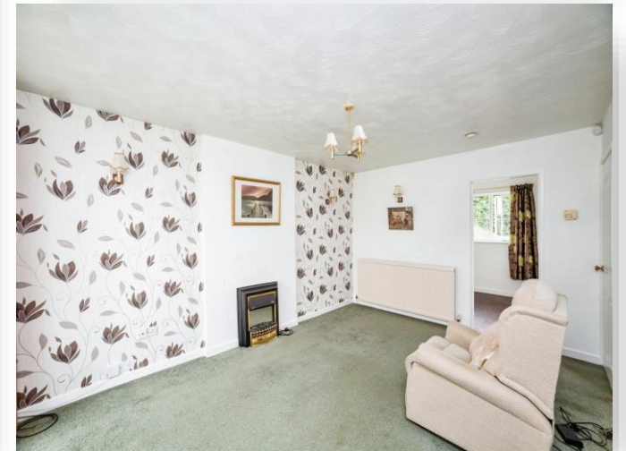
Larkspur Close, Swinton MEXBOROUGH S64 8PJ