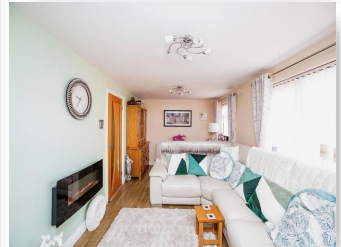
Glen view Harlington Road, Mexborough S64 0LD