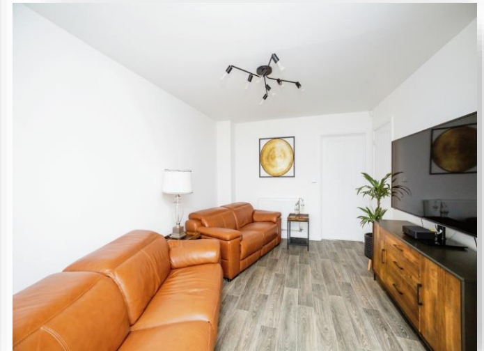
Rosefinch Road, Goldthorpe Rotherham S63 9FS