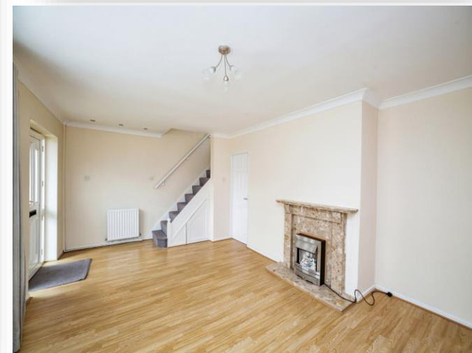
Ash Grove, Conisbrough Doncaster DN12 2HH