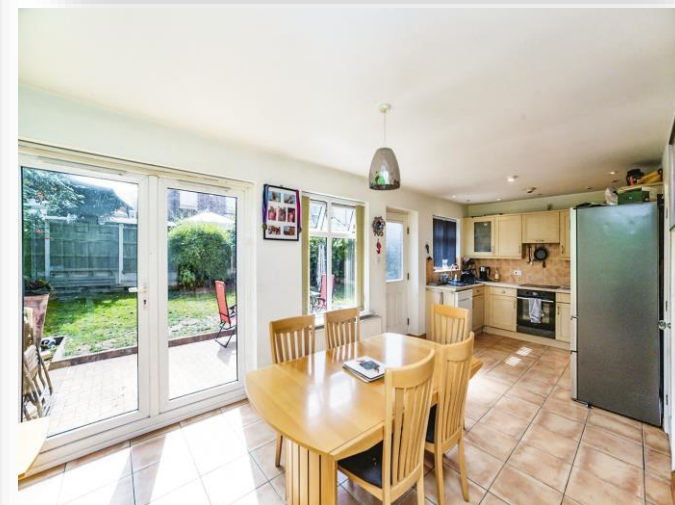
Low Golden Smithies, Swinton Mexborough S64 8DG