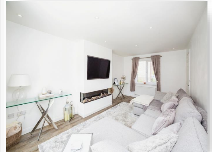
Fossard Gardens, Swinton Mexborough S64 8FB