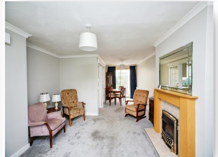
Clayfield View, MEXBOROUGH S64 0PR