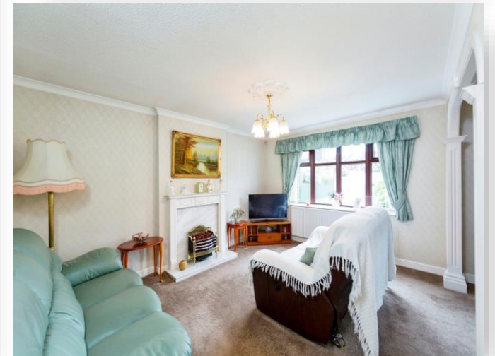
Holmoak Close, Swinton MEXBOROUGH S64 8UF