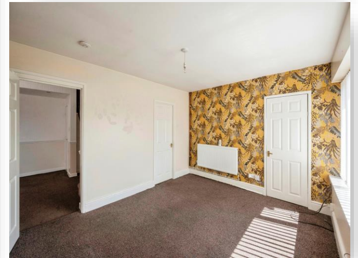
Hickleton Court, Thurnscoe Rotherham S63 0QF